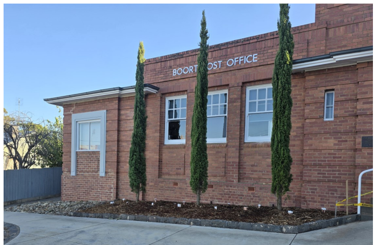
Garden surrounding Boort Post Office after a substantial green trim on a sweltering summer's day

About Boort is produced by the Boort Resource and Information Centre, 119-121 Godfrey Street, Boort Vic 3537 Contact BRIC on 5455 2716 or email info@boortbric.net to submit articles or receive the About Boort via email or volunteer your services in any way. Thank you to Loddon Shire Council and advertisers for your support.