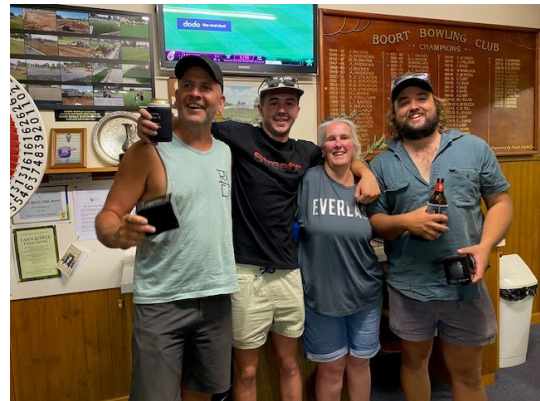
Marnoo & Ballarat Team - Runners-Up Bare Foot Bowls