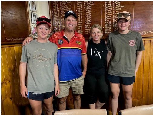
Cohuna Team - Winners of the Bare Foot Bowls