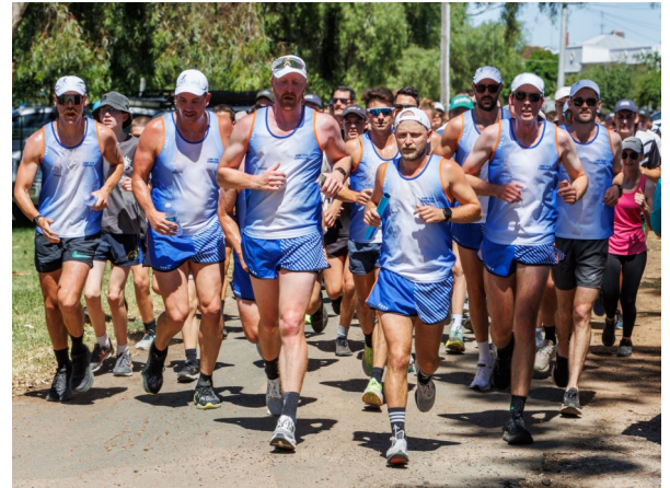
Above: runners approaching Boort; Right: runners joined by local supporters near the finish line.

What an incredible effort by the runners and support crew, and a heartwarming response from the community.